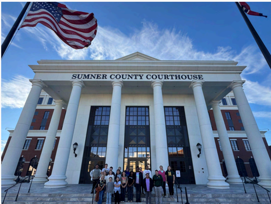
Pictured above: Howard Elementary School Criminal Justice club outside the new Sumner County Courthouse in Gallatin, TN

The Triad is the official digital newsletter of the Sumner County Sheriff's Office- School Resource Officer Division. In our quarterly-released publications, we will highlight the new and noteworthy happenings with our SROs across Sumner County (TN).